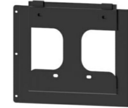
Model: RW-M6.1-Hboard Details: 3kg(Appr.)